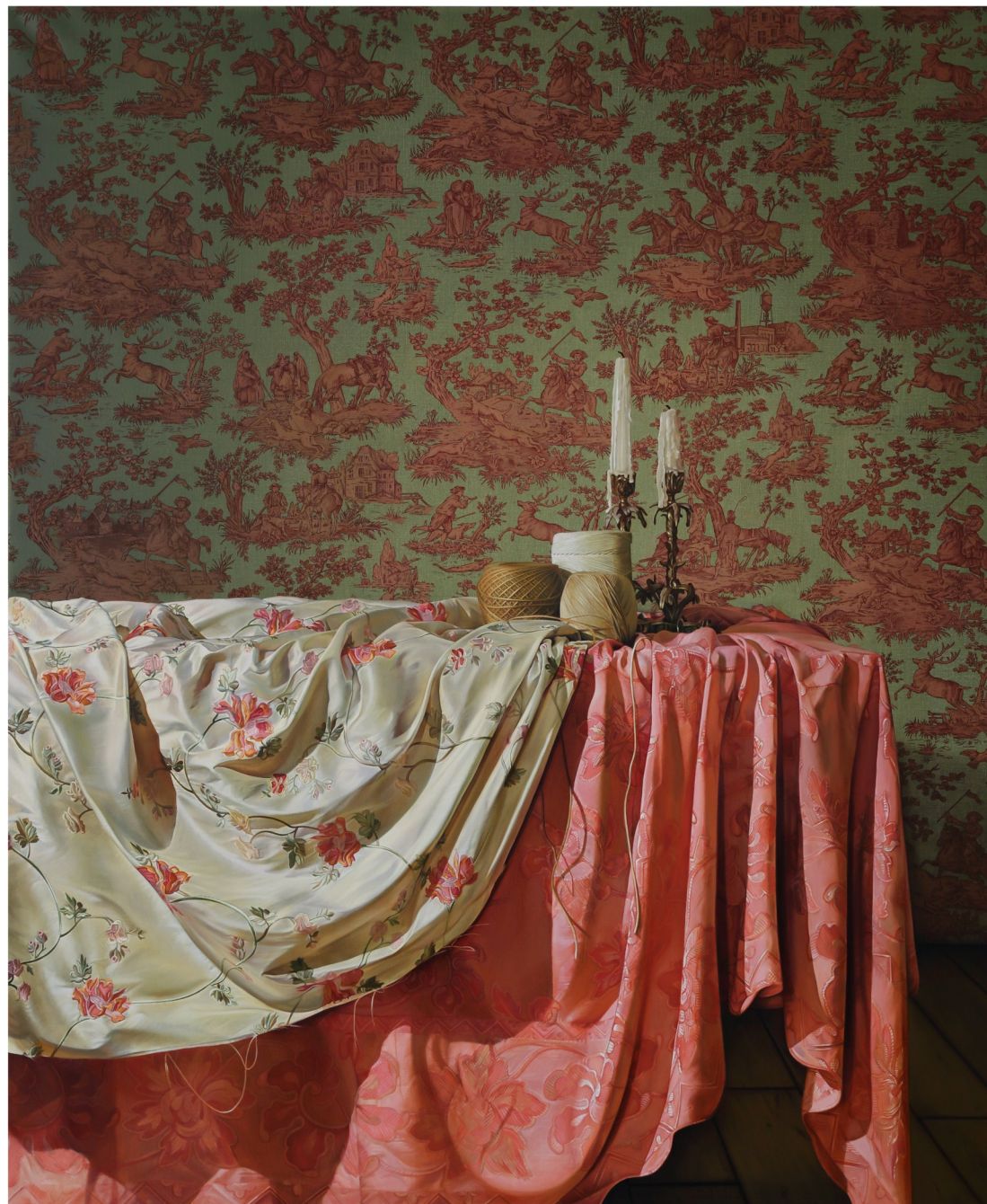
Image: Jennifer Trouton, The Ties that bind , 2013, oil on linen, 6x5ft